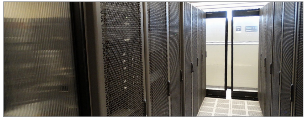
▲ University Data Center

When a large university data center experienced a flash fire/arc in a power distribution panel, soot and smoke engulfed the entire facility, affecting network and server equipment. This particular data center operates approximately 50 percent of all university computer traffic as well as critical operations for the university's hospital call system making it vital to get the data center fully back up and running as quickly as possible.