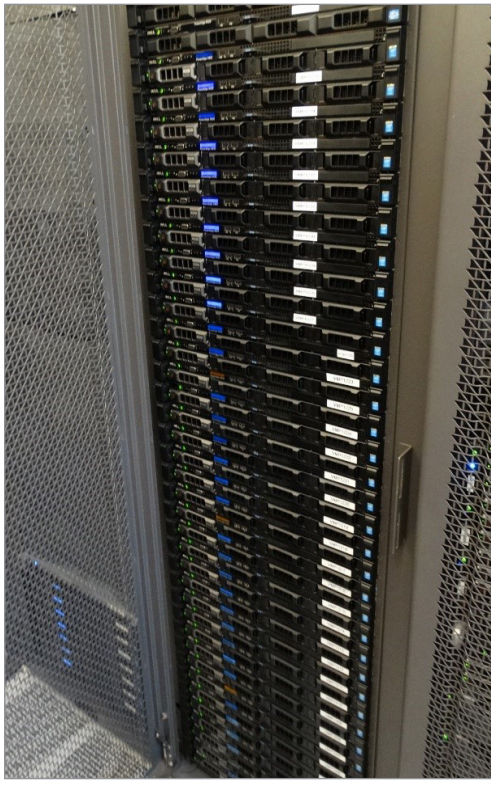
▲ University Data Center Equipment