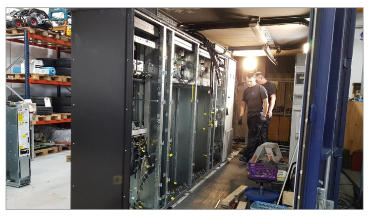
▲ AREPA experts performing decontamination