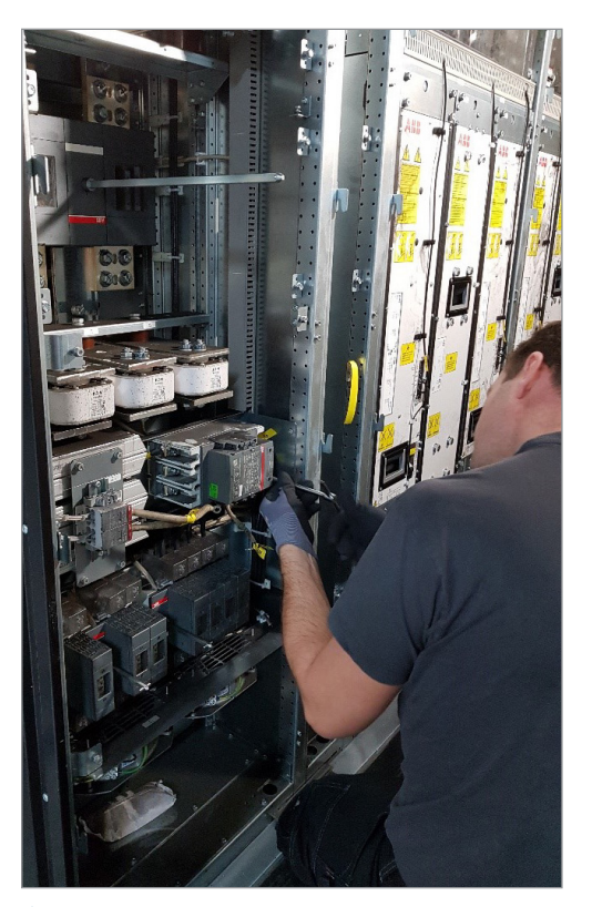
▲ The container and switchboards being disassembled