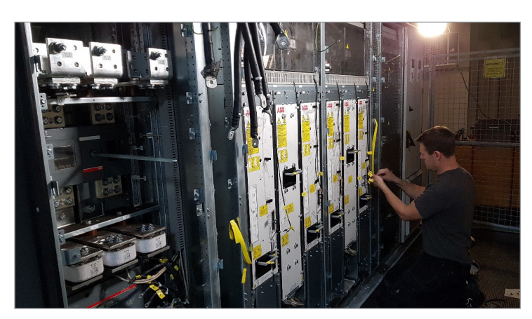
▲ AREPA expert performing decontamination