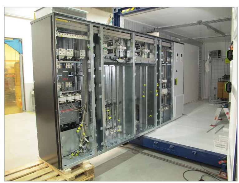
Reassembly of electrical switchboards and container

During idle connection based in Stavanger, Norway, this unit was struck by lightning. The producer was alerted about smoke and electrical failure and upon arrival, opened a smoke-filled container. Everything within the container was contaminated and bad thermal damage hit the upper-left corner of three to four switch panels containing lots of cable and cable trays as well as the components in the top of the installations, the smoke detector, and other armatures. As units were built halon-free, there was no concern regarding corrosive ions. When the loss adjuster arrived on site, he noticed indications of corrosion forming on the galvanized surfaces.